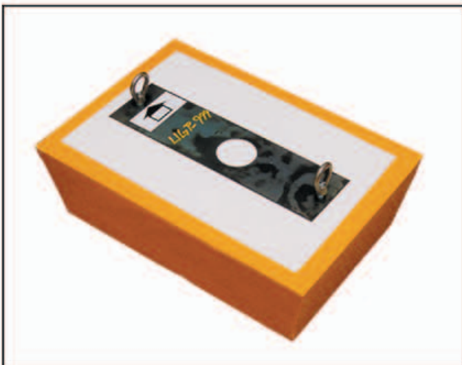
UNISORB Grout Pocket Forms are unique.

Our grout pocket forms are unique, and make placing grout pockets simple. The form is simply slid over the anchor bolt and secured with the top of the form even with the top of the foundation. After the foundation is poured and stripped, the form is simply removed from the concrete by pulling up on the eye nuts supplied with it. Your grout pocket is now ready for use.