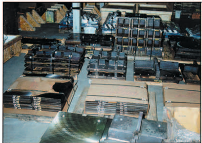
A large inventory of parts and kits are in stock.