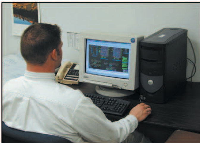
General design including civil/structural engineering

UNISORB'S engineering staff, the most experienced in the industry, can provide services ranging from conceptual design to complete construction ready packages including construction management and inspection services. Whether providing a simple design review or a complete turnkey package, our staff is uniquely qualified to identify the critical elements of your project, and assure that they receive the attention they deserve. Our decades of experience creating cost effective, successful installations is at your disposal in producing a quality installation which will impact your machine's performance throughout its useful life.