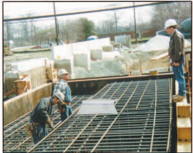
Construction documents and coordination

UNISORB provides engineered construction documents for general contractors to use for bidding and construction. These include complete project specifications to assure that critical construction issues are identified and completely defined. Also included is a detailed list of criteria for the inspection and approval process. This documentation assures a smooth, delay free project. We will provide complete construction management, coordination of contractors, and inspection services as desired, assuring minimum project completion times.