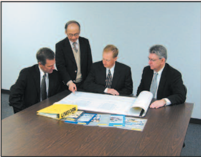
Expand your project team with UNISORB'S proven expertise.